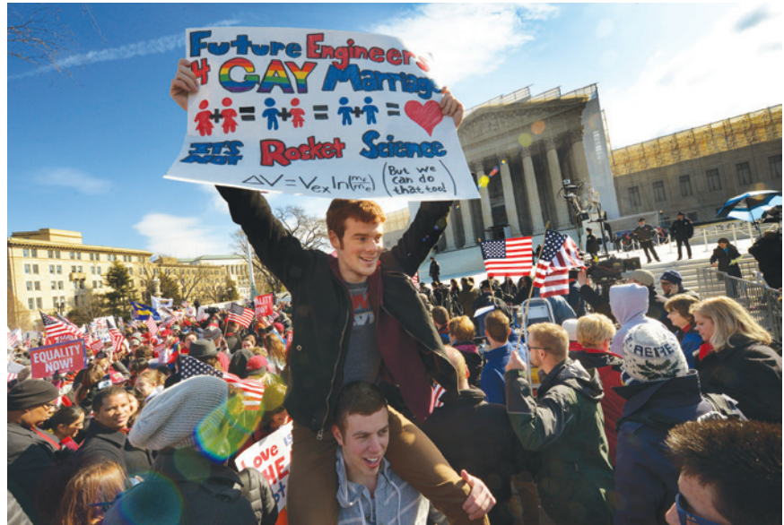
While the Supreme Court justices heard oral arguments in United States v. Windsor , crowds of activists from both sides of the debate gathered in front of the building.

fishing licenses between spouses” (Peters 2008:A1). The government’s definition also lends credibility—or legitimacy—to some families and contributes to a sense of isolation or exclusion for those whose families do not conform.